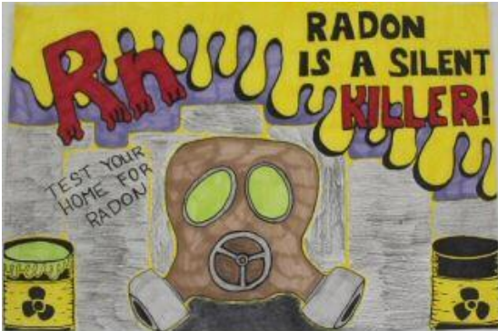
2016 Iowa Poster Contest Winner

The American Lung Association in Iowa and the Iowa Department of Public Health launched their annual Radon Poster Contest during National Radon Action Month. Students 9 to 14 years old are encouraged to submit self-made posters that help build awareness and encourage testing. Winners are eligible for cash prizes of up to $300. Posters are due March 2. Project guidelines and entry form can be found here .