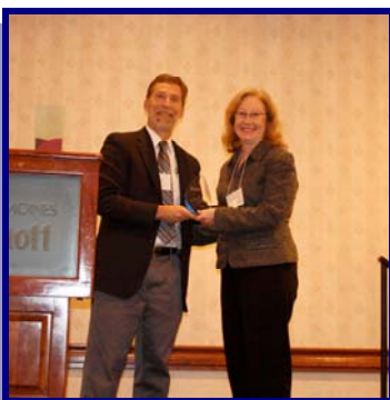
The Leukemia & Lymphoma Society's Iowa Chapter receives the Third Annual Iowa Cancer Champion Award