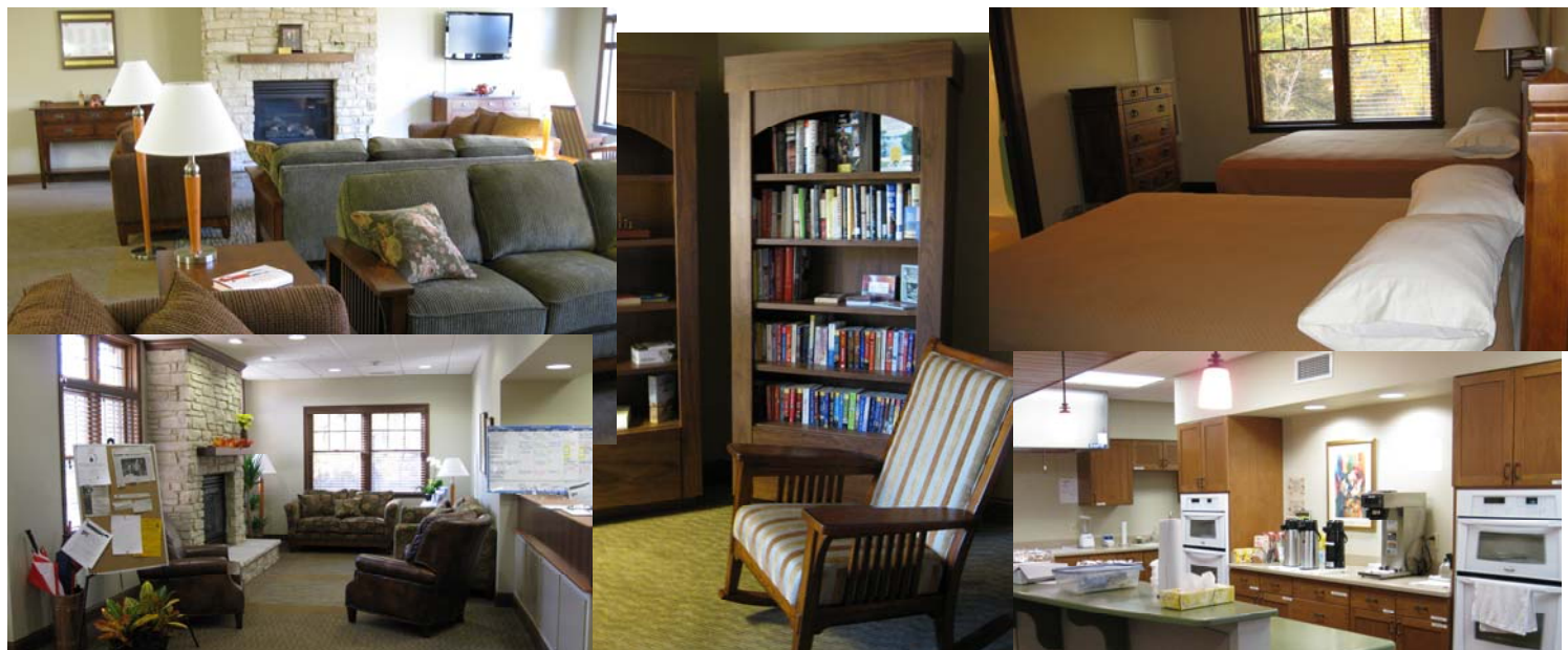
Clockwise from top left- One of the many family rooms at Hope Lodge; library; guest room; shared kitchen area; registration area.